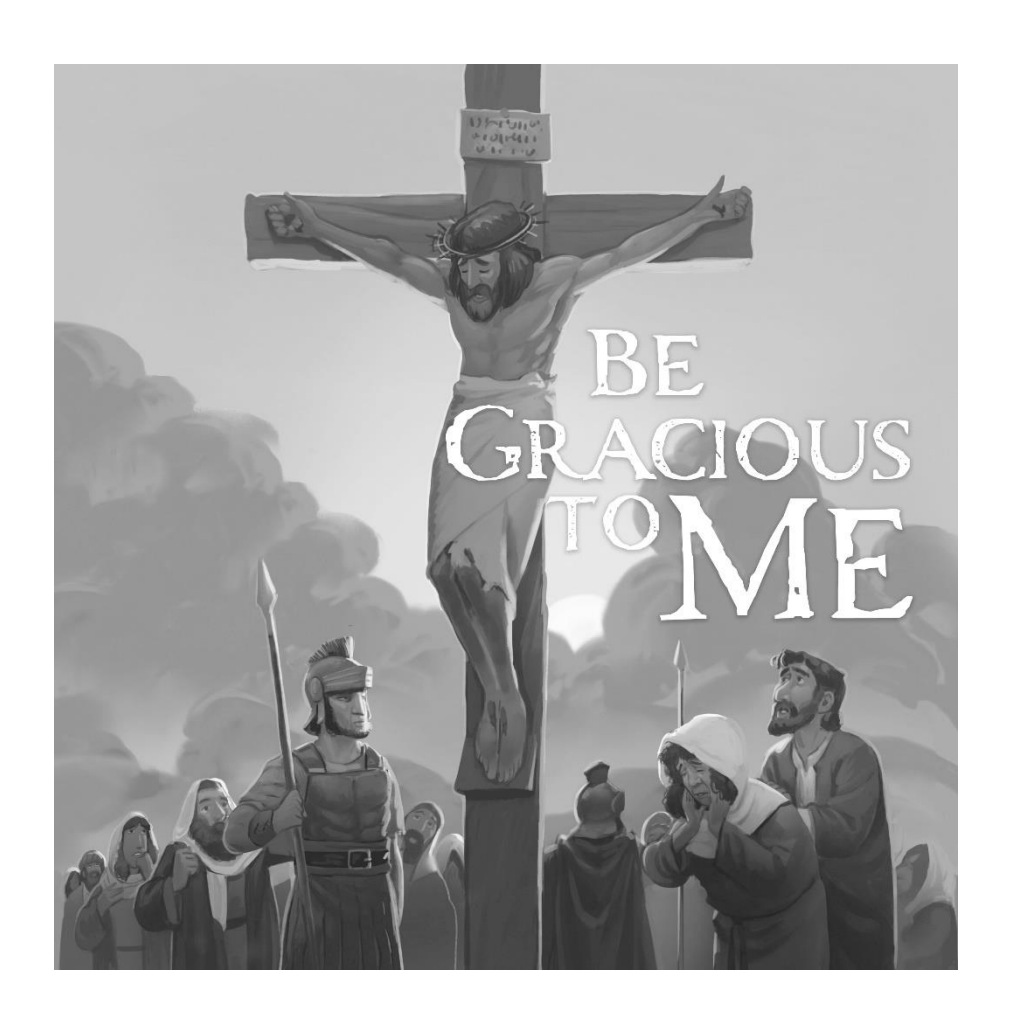
Midweek Lent 5

A Community of Faith: Centered in Christ – Called to Serve